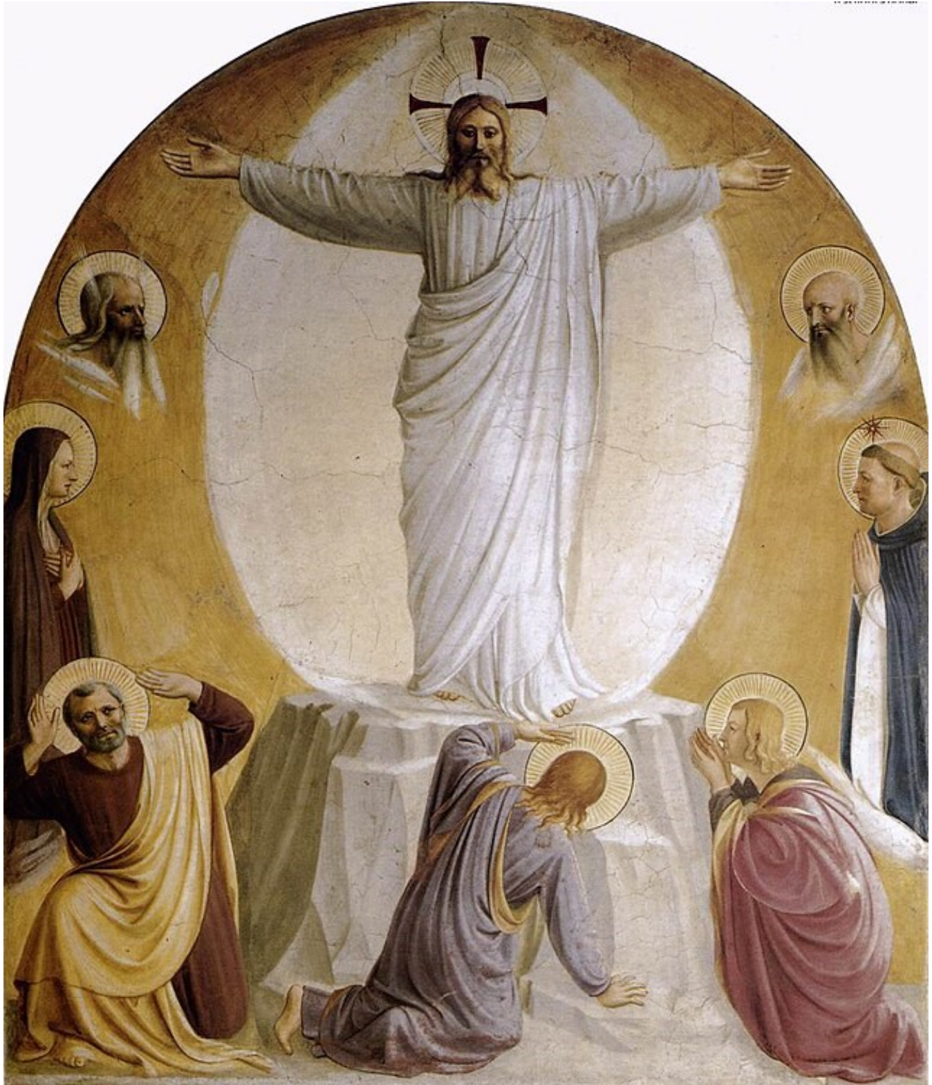
TODAY'S GOSPEL: THE TRANSFIGURATION