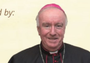
BISHOP PHILIP EGAN

© Catholic Diocese of Portsmouth 2023 | Registration number: England Registered Charity No. 1199568 Jersey Registered Charity No. 457 and Guernsey Registered Charity No. CH263