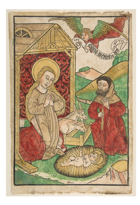
Image: created by Wolfgang. Copy of print c.1470. CC0 public domain dedication.

Vigil (Sat): 6.00pm +Catherine Holland 10.00am +Rae Moore