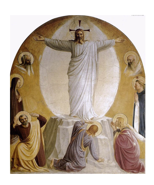
Image: The Transfiguration of Jesus, by Fra Angelico, fresco c.1440

MASS INTENTIONS: Please contact Lizzie if you'd like Mass offered for a special intention, in thanksgiving, or for loved ones alive or deceased.