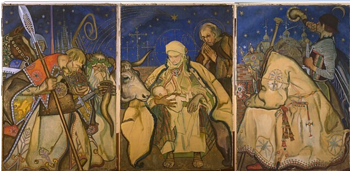
Image: Kazimierz Sichulski - Adoration of the Magi triptych, 1913. Public Domain.

SUNDAY 4TH JANUARY 2026 SECOND SUNDAY AFTER THE NATIVITY